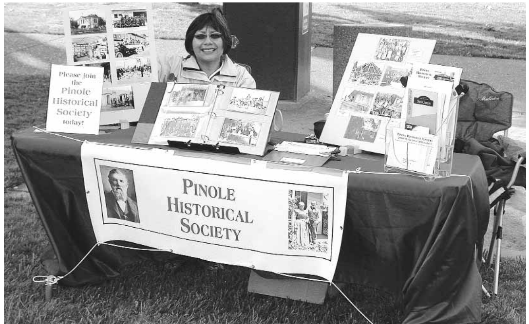
Visit the Pinole Historical Society volunteers at the Summer Sounds concerts on Thursday nights in Fernandez Park.