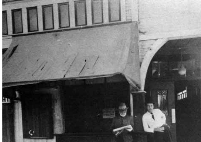
Silvas Saloon and the Golden West Hotel, Tennent and San Pablo avenues.

We have more activities planned for 2009, including docent-led Old Town Pinole tours and more lectures at our meetings.